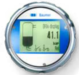
Tank visual (tank/bottle)