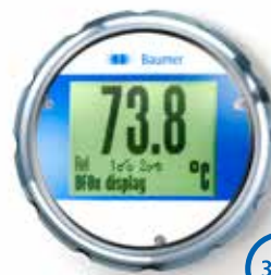
Display can rotate 360° (in both directions)