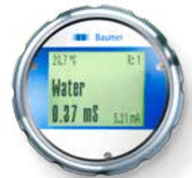
Media label (customer defined)