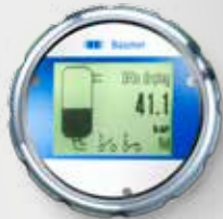
Green = ok

Why waste more than a second determining whether you need to take action?