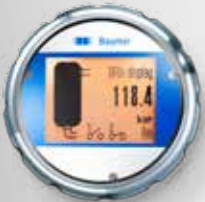
Red = take action