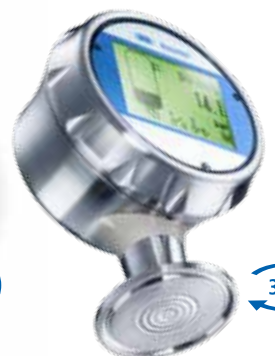
Connection can rotate 345° (bottom connection only)