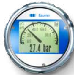
Analog (with/without value)