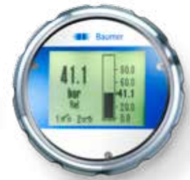
Bar graph (vertical/horizontal)